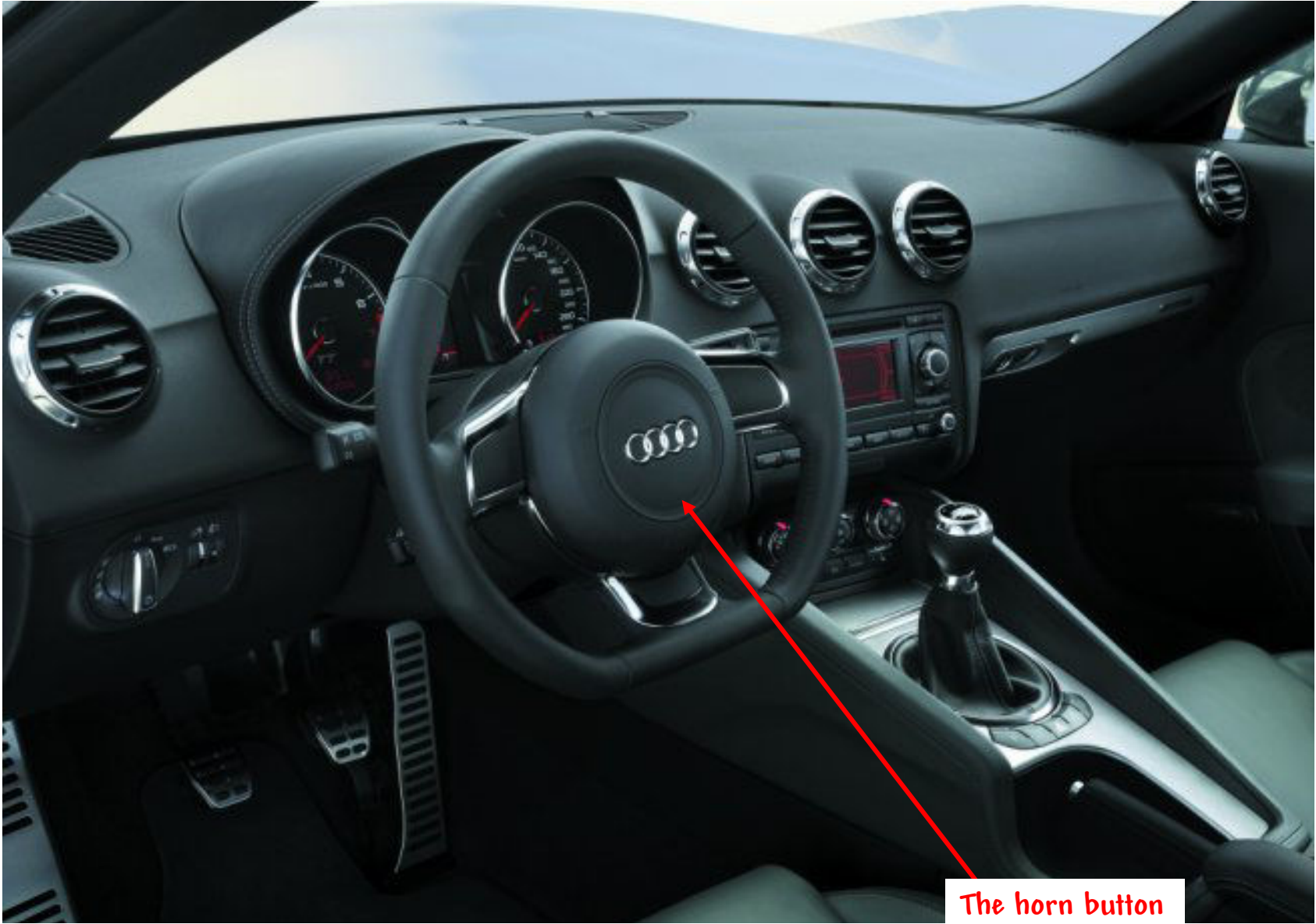
The horn button