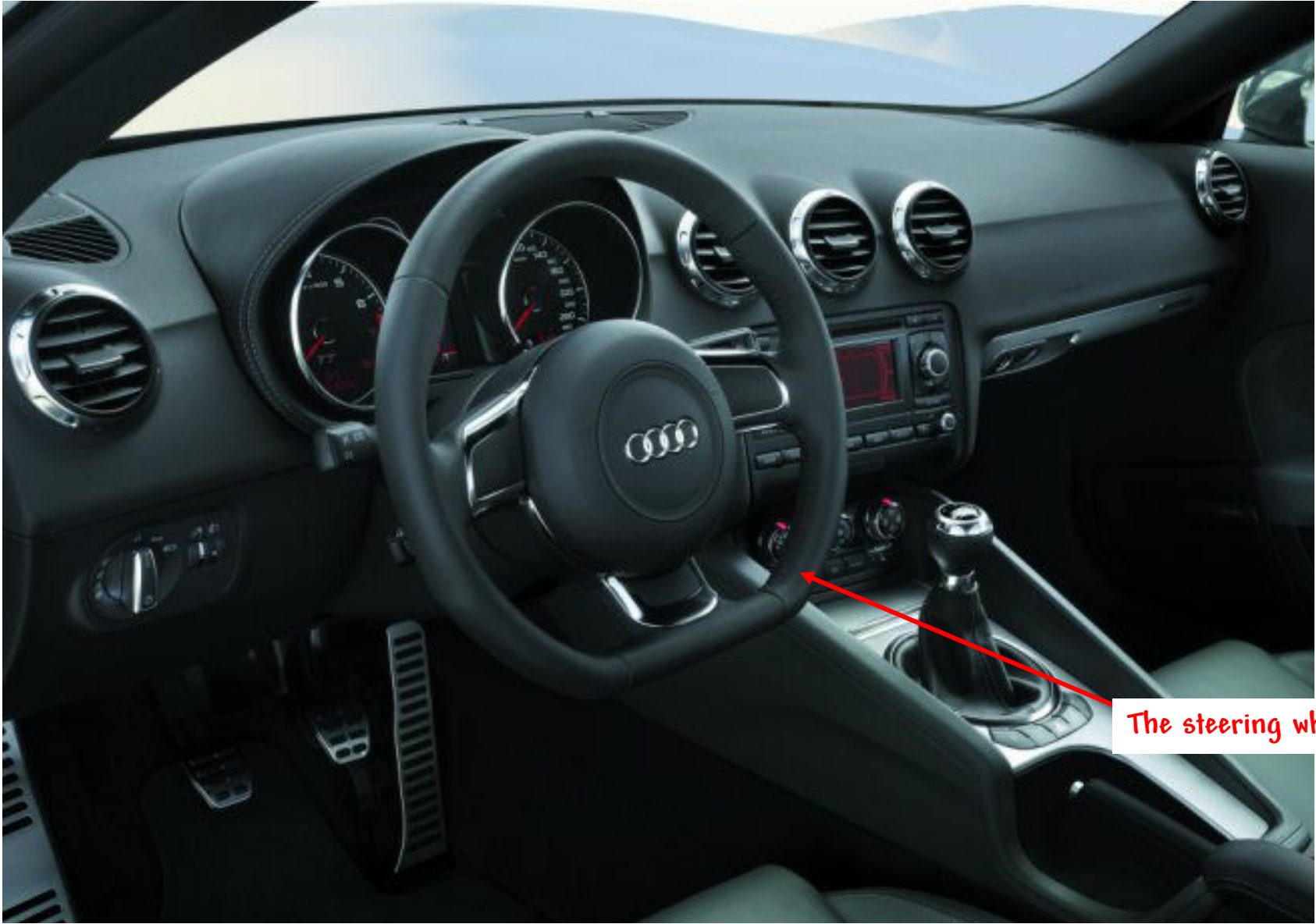
The steering wheel