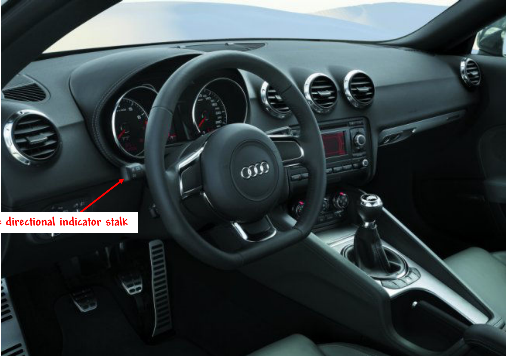
The directional indicator stalk