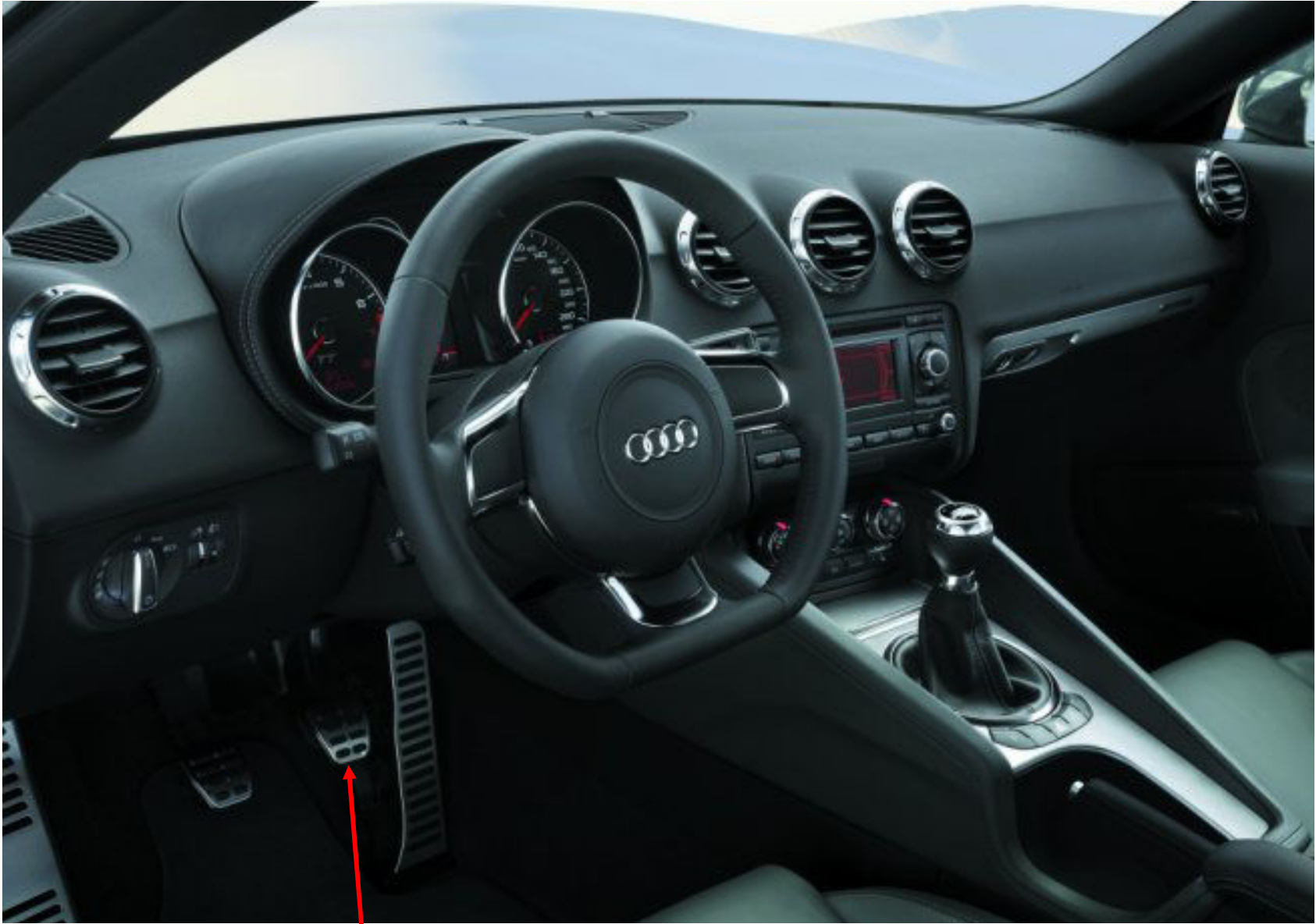
The brake pedal