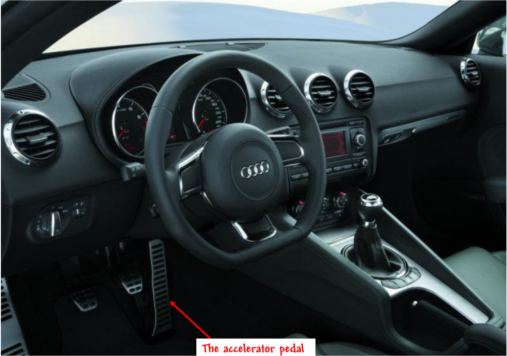
The accelerator pedal